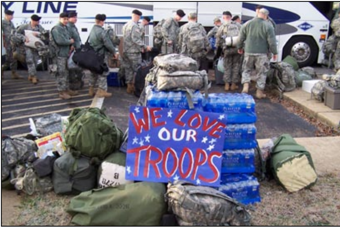
GUARDSMEN of A Troop 1/278 Armored Cavalry Regiment move out for training before deploying to Iraq.