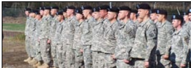
A TROOP 1/278 Armored Cavalry will train in near Hattiesburg, Miss, for two months before Iraq duty.

National Guard units from throughout Tennessee, including the state's largest unit, have reported to pre-mobilization training sites as the first leg of a deployment to Iraq and Afghanistan. Their departure represents over 3,000 men and women and brings the total number of Tennessee Guardsmen deployed since Sept. 11, 2001, to nearly 20,000.